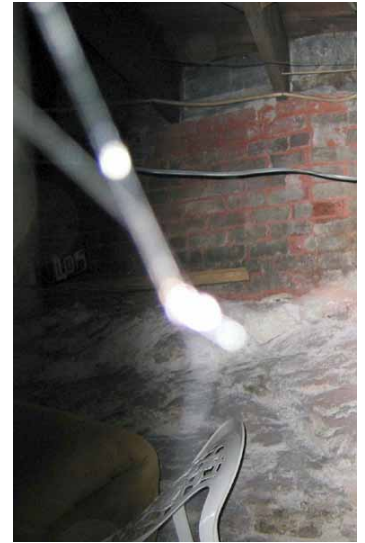
Spider web.

One way of helping those of us who want to interpret our photographic results, is to keep a photographic journal. Any type of notebook will do, such as a spiral bound tablet or a loose leaf binder. Different cameras are capable of producing artifacts with subtle differences that should be noted when interpreting a photograph. To enable this, it is a good idea to maintain examples of various naturally occurring artifacts that were taken by each camera that is used for investigations. I typically use three different cameras so in my notebook, under each category and example, I include one picture from each camera type.