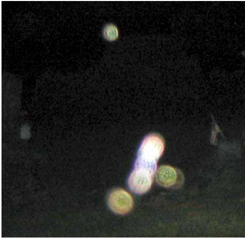
Insect in camera flash.

Serious paranormal researchers and investigators today are very aware of the importance of collecting credible evidence. It is no secret that the field of paranormal research is regarded with skepticism by many and especially by scientists who refuse to acknowledge the validity of what they refer to as a "pseudo-science." In spite of this attitude, many qualified and responsible people continue to attempt to prove what cannot be measured or quantified.