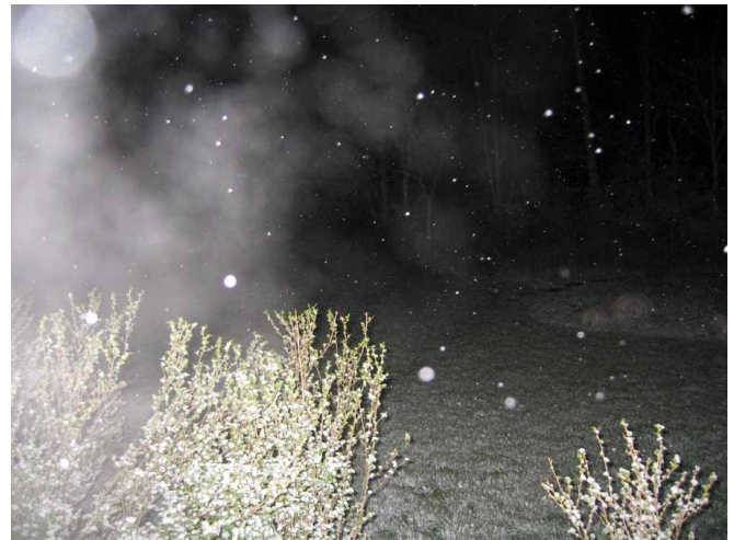
Breath and snow flakes. By Kathy Conder

Below are some examples of conditions under which photographs might be taken. These are conditions that commonly produce anomalies that may be mistaken as paranormal in nature. These are just basic examples. It is important to remember that you will probably find others to add to this list. The more extensive your notebook of examples is, the broader your base for comparison. This will lead to more reliable results. Remember that each photograph taken under these conditions will vary according to temperature, light, barometric pressure, and other atmospheric conditions, so be sure to note each detail of the current conditions in which the photo is taken. Sometimes, something as simple as the strength of your camera battery may have an impact. If your flash is strong, it will reflect differently than when the battery is low and the flash is not as bright. Your notebook will be a continuing work in progress as you add to it.