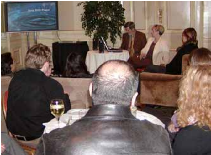
New York EVP Party, October 2004