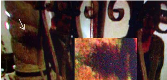
Orb (white arrow) moved from center frame to left exit in White Noise DVD, “Hearing is Believing.” Universal Films

We were able to find this one. It is between 2:39 and 2:40, near the beginning of the third feature. The cameraman was not using a light, and there is no evidence that a physical object moved in the scene. It looks like a gray shadow about the size of a softball (above and in insert), and at one point, it is between the camera and the vertical banister support—convincingly not normal.